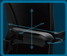
4D ADJUSTABLE ARMREST