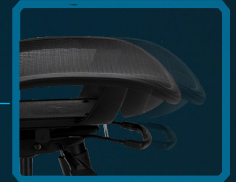
AIR BASE SLIDE ADJUSTMENT