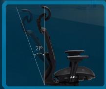
21° RECLINE TILT