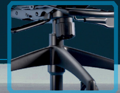
TÜV CERTIFIED CLASS4 GAS LIFT