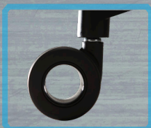
HOLO WHEELS, SOFT, QUIET & DURABLE