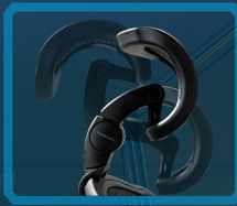
ULTRA WIDE ANGLED HEADREST, 2D NECK ADJUSTMENT