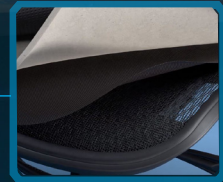
Multiplex leather Hybrid CUSHIONING (E5-Hybrid)