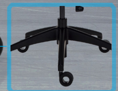
LIGHT WEIGHT & ANTI-CORROSIVE ALLOY WHEELBASE